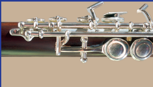
Cover image: Minor's curious flute; photo courtesy Robert Bigio.