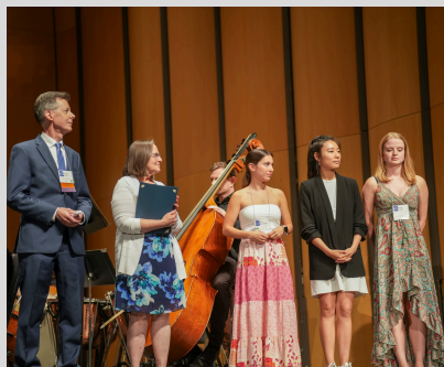
Representatives from Keefe Piccolos prepare to present awards for the 2024 Piccolo Artist Competition