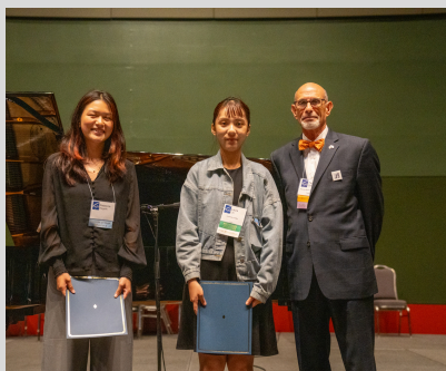
A representative of Brannen Brothers Flutemakers, Inc. with winners of the 2024 Orchestral Audition & Masterclass Competition