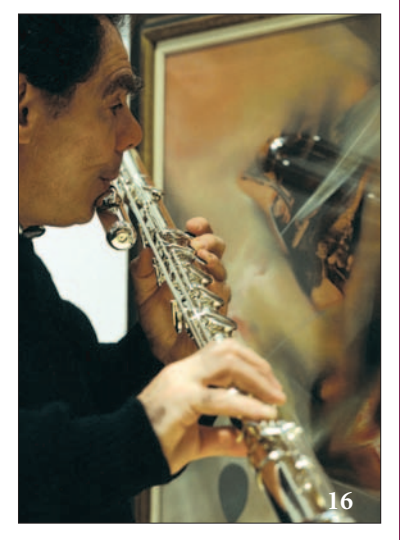
Table of ENTS WINTER