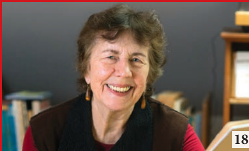
Cover image: Photo by Cynthia DelConte

THE NATIONAL FLUTE ASSOCIATION 70 E. LAKE STREET, #200 CHICAGO, IL 60601